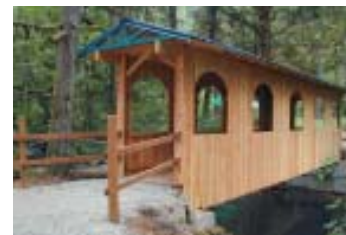
Covered bridge over Drift Creek.

A fire circle is located near the lodges where up to 120 can gather for an evening program.